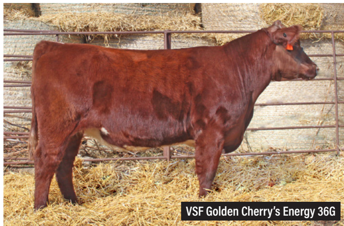
VSF Golden Cherry's Energy 36G

CE: 14 BW: -0.5 WW: 41 YW: 63 Milk: 24 REA: 0.93