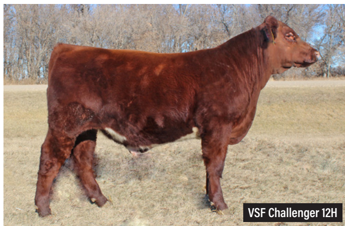
VSF Challenger 12H

515 10th Street NW • Watertown, SD Phone 605-886-3050