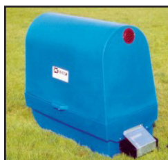
Koehn Calf Warmer