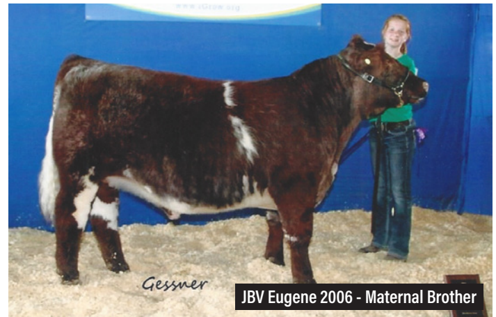
JBV Eugene 2006 - Maternal Brother

CE: 10 BW: 1.9 WW: 41 YW: 64 Milk: 24 REA: 0.27